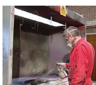
Figure 4 Fixed capturing hood